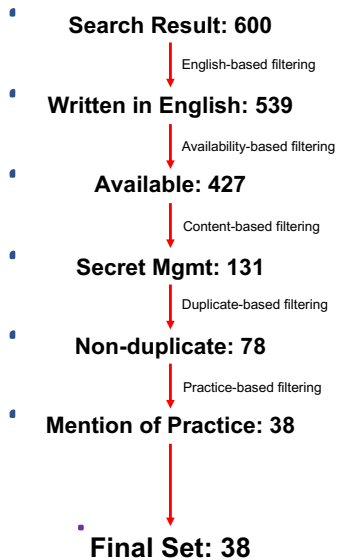
Fig. 4: Application of our inclusion criteria to collect our set of 38 Internet artifacts that we use in our paper.

is specific for Hiera, a secret management tool that can be used to manage secrets for Puppet. Even though Hiera helps practitioners to avoid hard-coding secrets in Puppet scripts, use of Hiera can negatively impact readability. To mitigate the problems with readability, practitioners advocate to store secrets that are used by few Puppet scripts at the top of the hierarchy, whereas the secrets used by many Puppet scripts should be stored at the bottom. In this manner, readability can be achieved as the practitioner will know the secrets that are used by many Puppet scripts are available at the bottom of the Hiera data hierarchy, whereas the secrets listed at the top of the hierarchy have limited use cases. We provide an example in Figure 5 that demonstrates how secrets shared across a few scripts can be placed at the top level (line#2-3), whereas secrets used by all Puppet scripts can be placed at the bottom level (line#11-12).