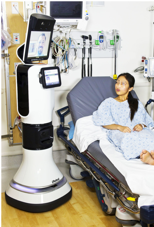
Fig. 5. Robot that assists patient in hospital via Telemedicine systems

As motion control technologies have advanced, surgical assisting robots have become increasingly precise. These robots help perform complex microprocedures without the need to make large incisions. As surgical robotics evolves, robots will need to be increasingly based on artificial intelligence and will ultimately use computer vision to navigate to specific areas of the body, while avoiding nerves and other obstacles. Some surgical robots may even be able to complete tasks autonomously, allowing surgeons to monitor procedures from a console.