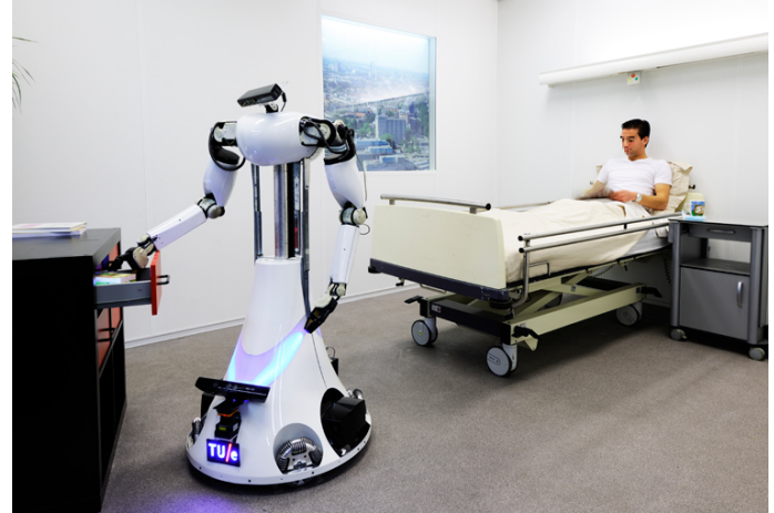
Fig. 4. Robot improving patient care during isolation

to be used not only in the operating room, but also in clinical settings to support healthcare workers, improve patient care, or for example, for activities to reduce exposure to disease agents (Fig. 4). It is now clear that the operational efficiency and risk reduction provided by healthcare robotics offer value in many areas. In addition, for instance, robots are able to clean and prepare patient rooms independently, helping to limit person-to-person contact in infectious disease wards. Robots with AI-based medicine identification software reduce the time it takes to identify, establish and distribute medicines for patients in hospitals.