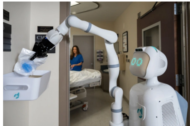
Fig. 6. Robot that assists patient in hospital in different tasks

Moreover, service robots will need to help keep health-care workers safe by transporting supplies and bedding in hospitals, where exposure to pathogens is a risk (see Fig. 6). Cleaning and disinfection robots will also limit exposure to pathogens and help reduce hospital-acquired infections. In addition, social robots will be able to provide more and more assistance in hospitals, such as lifting weights, moving beds, patients, trolleys with medicines, and thus helping to reduce the physical effort of health workers.