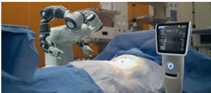
Fig. 3. Intelligent and autonomous surgery robotic systems

The first robots in the medical field offered surgical care via robotic arm technologies (Fig. 3). Over the years, computer vision enabled by artificial intelligence and data analytics have transformed healthcare robotics, expanding functionality into many other areas of healthcare.