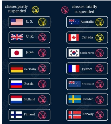
Figure 1. Class-suspensions in countries with the most Chinese students [6].

In summary, the delay of graduation and employment is inevitable. The overseas students who have already found a job, like the domestic students, also face the risk of the delayed entry to the work or the cancellation of their positions.