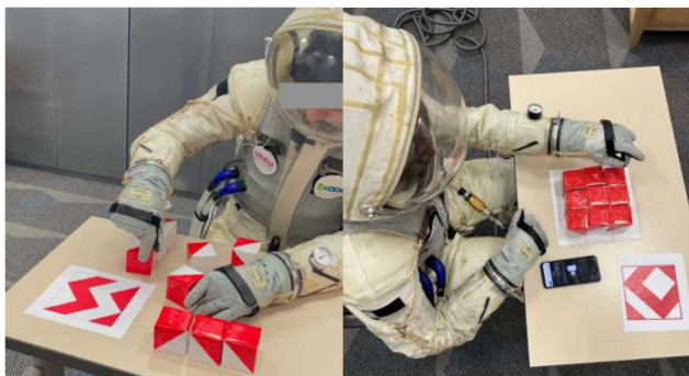
FIG. 2. Two participants undertake their respective Koh Block tests. Left: test is mid journey, sound transparency OFF. Right: start of the test. Note the smartphone placed on the table used to relay ambient sound to the participant (sound transparency ON).

(Fig. 2), students reported an inability to understand speech. Consequently, individuals wearing an IVA suit might face challenges in perceiving and interpreting auditory information, which could have a substantial impact on their cognitive performance and problem-solving abilities in situations where sound affects cognition [3], [7].