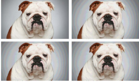
Fig. 2: Original (top left) and crafted image inputs.