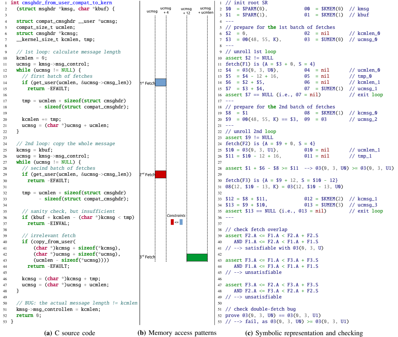
Fig. 7: A double-fetch bug in cmsghdr_from_user_compat_to_kern, with illustration on how it fits the formal definition of double-fetch bugs (7b) and DEADLINE’s symbolic engine can find it (7c).

This example also shows that although developers tend to exercise precaution to prevent double-fetch bugs , for example, by placing the sanity checks at line 36 (7a), such checks might not be sufficient as shown in line 28 (7c).