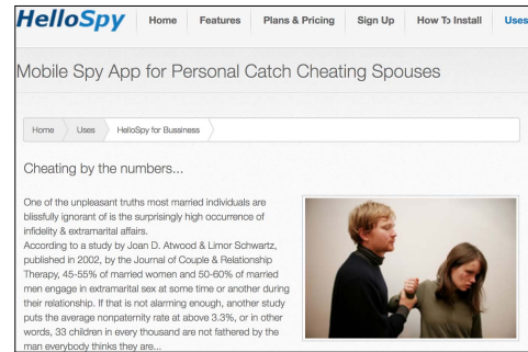
Fig. 1: Screenshot of the HelloSpy website promoting intimate partner violence [35].

store apps). While this labeling may be appropriate for other contexts, for IPV victims these tools are far too conservative. The tools do better detecting off-store spyware, but still fail to label some dangerous apps.