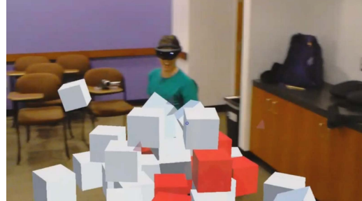
Fig. 3: This participant leveraged the opacity of virtual objects in the Shared Blocks application to hide from his partner behind a pile of blocks and pop out.

Using Virtual Objects as Physical Barriers. Building directly on an observation from Section IV-A above, we noted that participants sometimes used the opacity of virtual objects to their own advantage. For example, one participant crawled behind a pile of virtual blocks to hide from his partner and then popped out, as shown in Figure 3. Thus, AR enables new