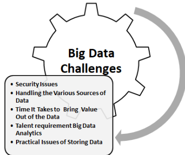
FIG. 3: BIG DATA INDUSTRY CHALLENGES

data capture, storage, searching, sharing, analysis, management and visualization. Additionally, distributed data driven applications also face security and privacy issues. The implementation of big data technologies also passes numerous challenges, which ultimately poses challenges to researchers and deployment experts [7]. Figure 3 illustrates the current challenges to organizations.