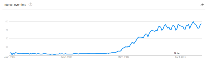
FIG. 4: GOOGLE TRENDS FOR BIG DATA

SMEs can derive value from voluminous data by utilizing and developing partnerships with big data technologies, be they in supply chain management, logistics, customer & business insight etc. The adoption of big data in SMEs can be fruitful in tackling key challenges of business [12]. As a matter of fact, the possibilities of big data are not fully explored by people & companies, but individuals are continuously finding big data term on Google to discover its benefits (see figure 4).