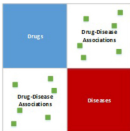
Fig. 2 Association matrix.