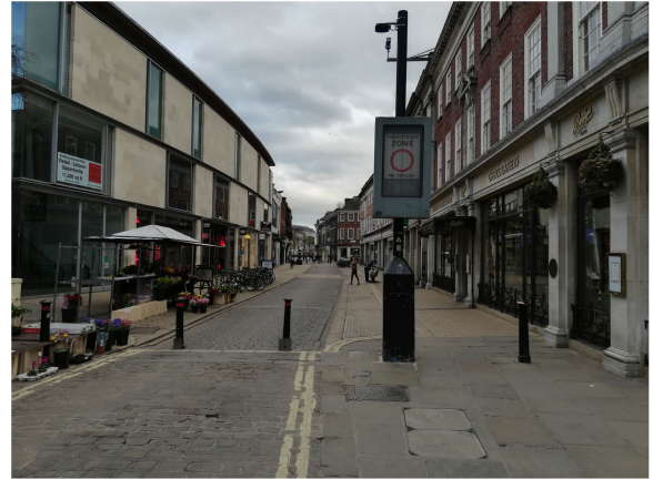
FIGURE 3. York has complex time-restricted pedestrian zones, and being caught out is a £50 fine.

Food quality depends on efficient collection and delivery, so it is common for riders to be summoned to collect an order before the food is ready. They wait, unpaid, while customers are told the food is en route. While riders can complain, so can the restaurant, and their complaints could result in rider dismissal. Riders are fixed into an awkward power relationship due to the asymmetrical rating systems used by platforms, providing restaurants and customers power over riders. There exists a tension in which the restaurant wants to ensure that riders are ready, but the added time of waiting at a restaurant by the rider leads to a loss of income. Customers blame perceived delays on riders, which can lead to poor ratings. Some riders have lists of restaurants from which they reject work because of how long they are made to wait. Poor ratings and complaints can lead to workers becoming deprioritized, which impacts available shifts, and could lead to eventual dismissal. The constant need to please restaurant workers and customers creates additional stresses and is a form of emotional labor. Concerns