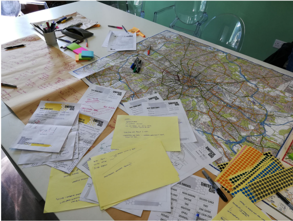
FIGURE 1. Workshops were rich and creative sharing spaces, lead to lots of interactions, data, new methods for engaging with riders, and design briefs.

challenges and risks that gig-workers face day-to-day. 9 Instead, workers gather in online forums, sharing screenshots, and building a common sense of inequities. 9 This leads to workers resisting algorithmic control through various forms of what Kellogg et al. 7 describe as “algoactivism.” Such algoactivism is leading to a growth of forums and apps, which aim to protect and support workers (cf., Turkopticon 10 ).