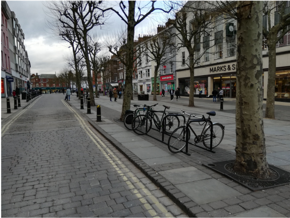
FIGURE 4. Bicycle racks were removed for a Christmas Market and were not replaced until March.

There exists a complex relationship with other road-using gig workers too. For example, taxi drivers in York would use dashcams to report moped couriers going the wrong way down one-way streets, though their help was provided to a courier who was knocked off their bike by a pedestrian, in handing over dashcam footage.