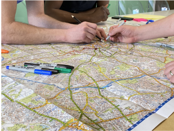
FIGURE 2. Annotating maps was effective for sharing tacit knowledge about the city and the work.

were explored using a range of probes, mind-maps, sketches, annotations of city maps, and storyboards, each of which worked toward answering a specific question (see Figures 1 and 2).