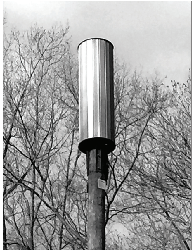
FIGURE 1. Antenna element for a small cellular base station mounted on a utility pole at a height of about 10 m.

But with the densification expected in 5G cellular systems, the number of base station sites and their spatial density will