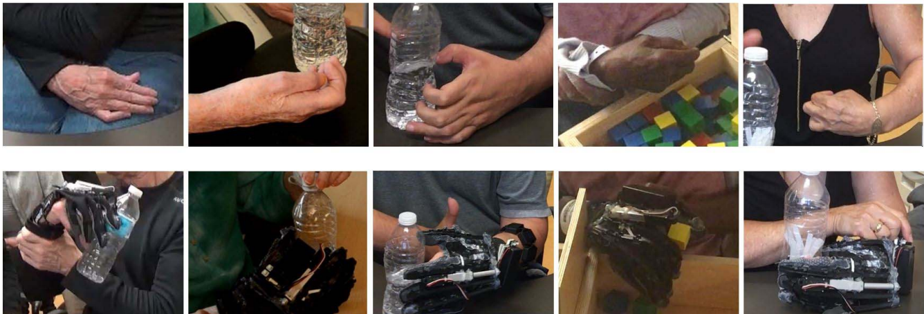
Fig. 3. Five stroke survivors with severe hand impairments evaluated the HERO Glove's assistive capabilities. The top images show the hand impairments of P1 through P5, respectively. The bottom images show how the HERO Glove was worn and operated by P1 through P5, respectively, to perform tasks independently. The HERO Glove's assistance enabled P3 and P5 to extend their fingers and thumb around the water bottle. The HERO Glove's assistance extended and flexed P1, P2 and P4's fully paralyzed hands to grasp the water bottle and blocks independently.

hand was best-oriented for the grasp. Then each participant trialed the manual and automated modes and supported their forearm with their unaffected hand. Each participant was able to control the robot's assistance in both the button-press and automated modes. P2, P4 and P5 did not trial the automated mode independently during the BBT because they were unable to move their affected arm with the accuracy required position their fingers around the blocks. P1 and P3 were able to use the HERO Glove in the automated mode to each grasp and transfer two blocks in one minute independently. P1 required the automated mode because it was difficult to press the button while supporting the full weight of his flaccid arm. P3 transferred five blocks independently in the button-press mode and preferred this mode to the automatic mode for its reliability and switching speed. P5 transferred three blocks in the automated mode, with the researcher supporting her forearm. The automated mode functioned perfectly for P1, P3 and P5, as all seven grasps and seven extensions required to transfer the seven blocks occurred when desired and without added delay or early release of blocks (0% false positives, 0% false negatives). All participants were experiencing global and muscular fatigue by one hour into the study so the BBT trials were not repeated.