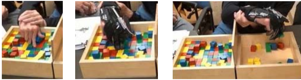
Fig. 2. The HERO Glove enabled stroke participants to transfer blocks during the Box and Block Test. The left figure demonstrates P1 attempting unsuccessfully to grasp a block with the affected hand, while supporting the arm with the other hand. The two figures on the right demonstrate P1 completing this block grasp and transfer task independently with the HERO Glove providing extension and flexion assistance automatically.