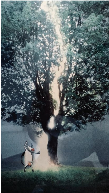
Figure 1. The poster illustrating the quiz.

through the body. This may be one reason for the therapeutic effects of being on the beach. [Italics added for emphasis.]