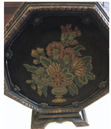
Figure 1. An item on display at the historical exhibit during IMS2018 in Philadelphia.

Marconi Maritime Center [5] I made during a family vacation on Cape Cod over the Memorial Day weekend in 2018. (Disclaimer: I did not drag my family from the beach to the wireless history museum; one of my daughters found the place and thought it would be fun to visit on a rainy day.) This small museum was established in 2002 in historic buildings that once housed Marconi's 1914