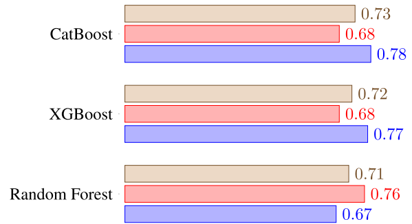
FIGURE 2. A/A detection performance and feature importance.

To handle the high level of class distribution imbalance of the input dataset, weighted classification was applied to improve detection performance. Also, grid search was used to optimize the performance of CatBoost and XGBoost by selecting their optimal hyperparameters. Random Forest classifier was run with default parameters, but using 200 estimators. All the classifiers were implemented in Python using