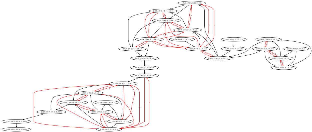
FIGURE 3. Conflicts graph of the running example addParametersToServiceUrl which belongs to the Knowage-core software project.

ways of exploring the search space because we set a number of evaluations as stopping criteria. If no stop condition is set, both variants must return an optimal solution.