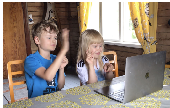
FIGURE 5. A preschooler and older brother studying at home, creating a model to recognize gestures [110] (GDPR compliant photo).

A number of ML education tools do not require exposure to the concept of algorithmic steps—on the contrary, some celebrate the shift from “coding to teachable machines” [15]. In training a model, in testing a model, and in connecting the model with actions, there is less a need for thinking about