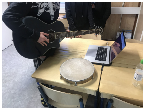
FIGURE 2. Ninth-grade students recording samples of musical instruments they wanted their ML app to recognize [111].

Instead of relying on explicitly hand-coded rules that a computer will follow on different inputs, many ML initiatives guide students to train ML models by giving the system a lot of data to learn from [21]. Studies have used drawings, poses, speech, and video [59], [111], as well as data from, for