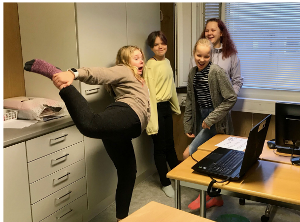
FIGURE 4. Twelve-year old children training an ML model to recognize cheerleader poses [111] (GDPR compliant photo).

opportunities for bodily interaction and natural language [16], [36], [37], [48], [102], [110]. For example, educational technology for learning ML principles allowed children to train PoseNet-based ML models to recognize different cheerleader poses (Fig. 4) [111].