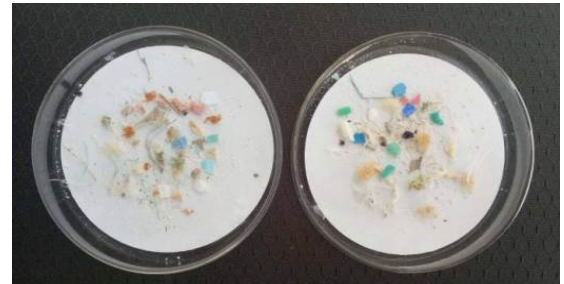
FIGURE 1. MPs pieces collected from sea beach in Wenzhou City.

The environmental MPs were sampled in Longwan seabeach (N120°53'34", E27°52'19", Wenzhou City, China), where various types of daily waste were drifted on the beach. The stainless-steel shovel was used to collect the upper surface layer of the sampling area. All the potential MPs samples were stored in glass containers and transported to the laboratory. Samples were immersed with 30% H 2 O 2 under dark surroundings for 24 hours to digest the potential organic matter and biological materials. Then, the samples were transferred into metallic trays, oven-dried at 60 °C for 0.5 hour. MPs samples were pre-selected with size of 1~5 mm and thickness of roughly around 1 mm. Samples in each type were selected by their external shape and color, to maximize the variance of the samples for subsequent analysis. Almost 600 samples were collected from the sampling area. Fig 1 shows some typical variety of samples.