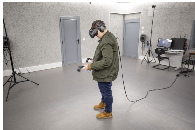
FIGURE 3. Participant performing the experience with HMD cables.

Participants performed the experiment at a specialized Virtual Reality Laboratory. The laboratory’s experimental room allows the full control of variables such as light, temperature, ambient air circulation, as well as, soundproof walls