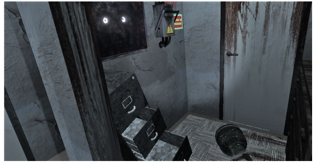
FIGURE 1. Screen shot of level 2 (illustrative example of the virtual environment, better visualised on screen).

There are three floors, each one corresponding to one level. The player starts in the first level inside a room where he must find a key to unlock a door which will give the player access