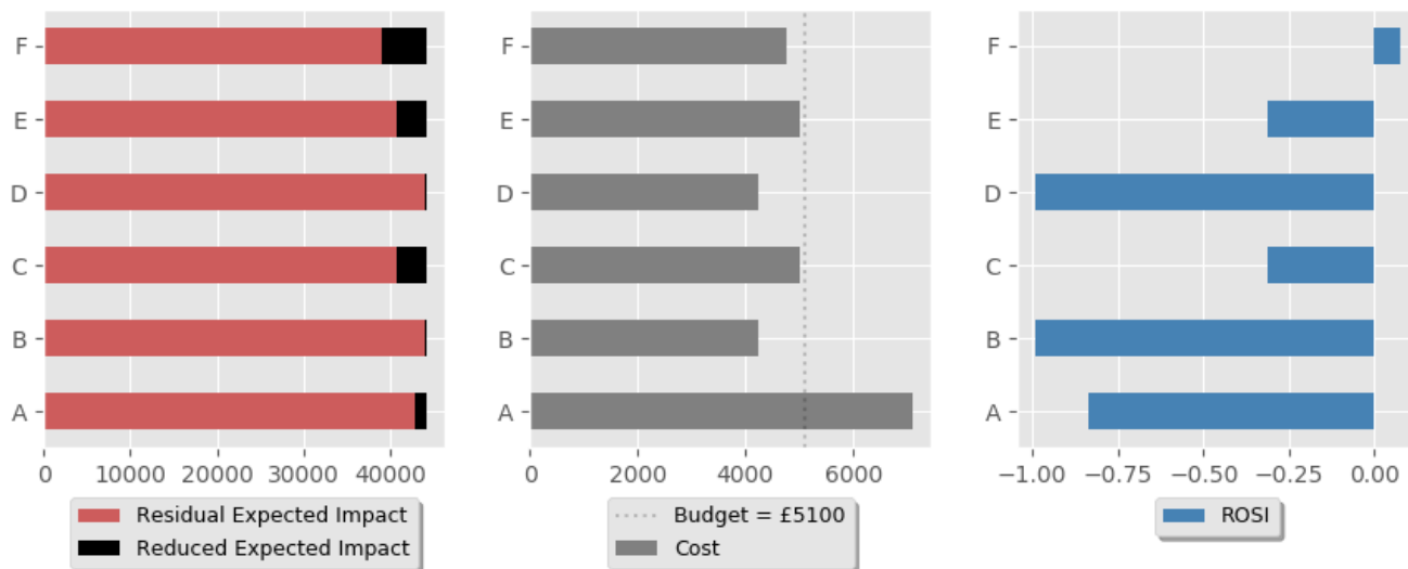
(A) Set cover with no constraint. (B) Set cover with budget constraint for subcontrols level L. (C) Set cover with budget constraint for subcontrols level H. (D) Set cover with budget and efficacy bound for subcontrols level L. (E) Set cover with budget and efficacy bound for subcontrols level H. (F) Knapsack Optimisation with budget