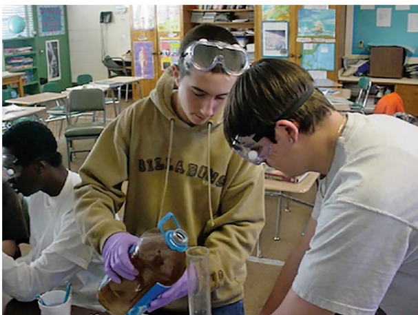
FIGURE 8. Students in a classroom collecting GLOBE program data.

science measurement protocols and education activities by attending a GLOBE teacher workshop. To find a workshop in your area, check the site https://www.globe.gov/get-trained/workshops .