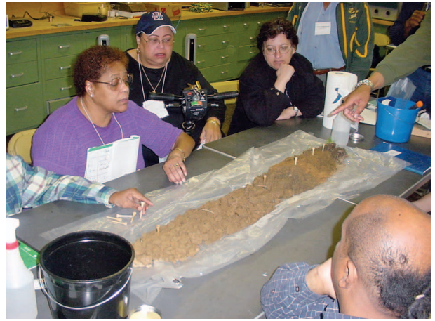
FIGURE 3. Teachers at a GLOBE program training event.