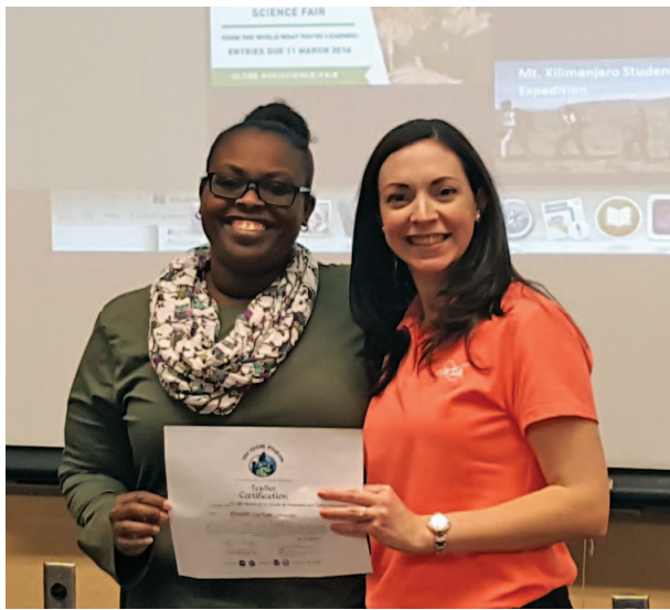
FIGURE 6. Two teachers during a GLOBE training event.