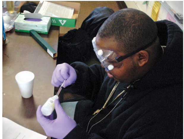
FIGURE 4. A student collecting GLOBE program data.