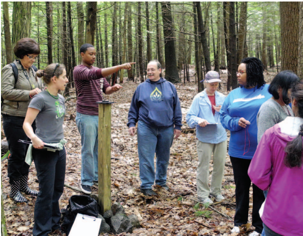
FIGURE 2. Teachers and students during a GLOBE exercise.