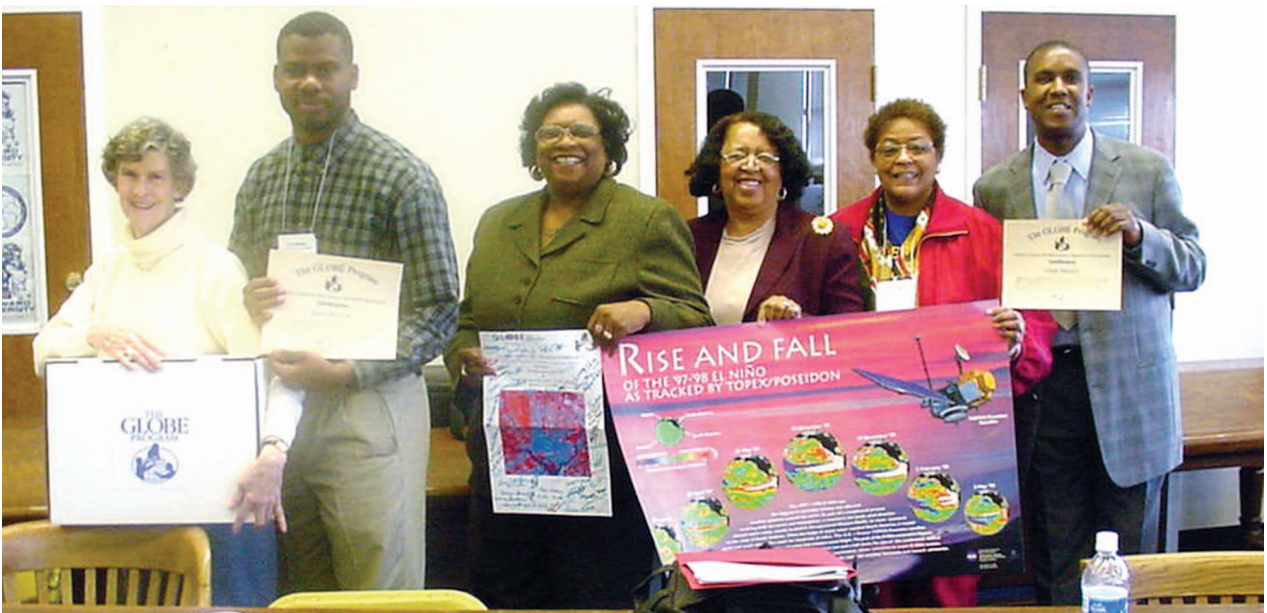
FIGURE 5. A group of teachers following a GLOBE training event.