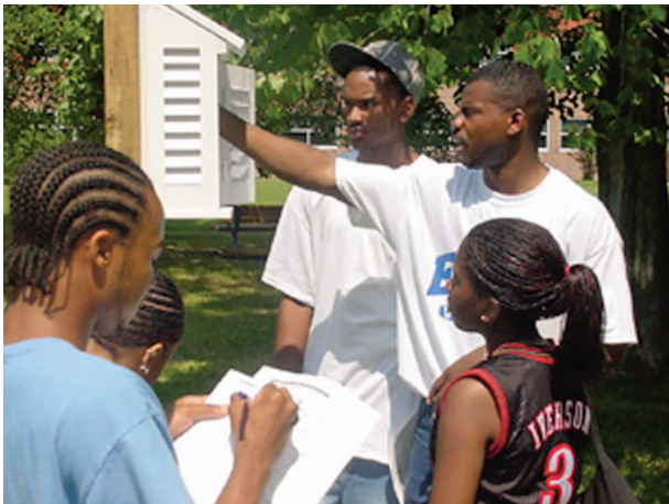
FIGURE 7. Students collecting GLOBE program data at an outdoor site.