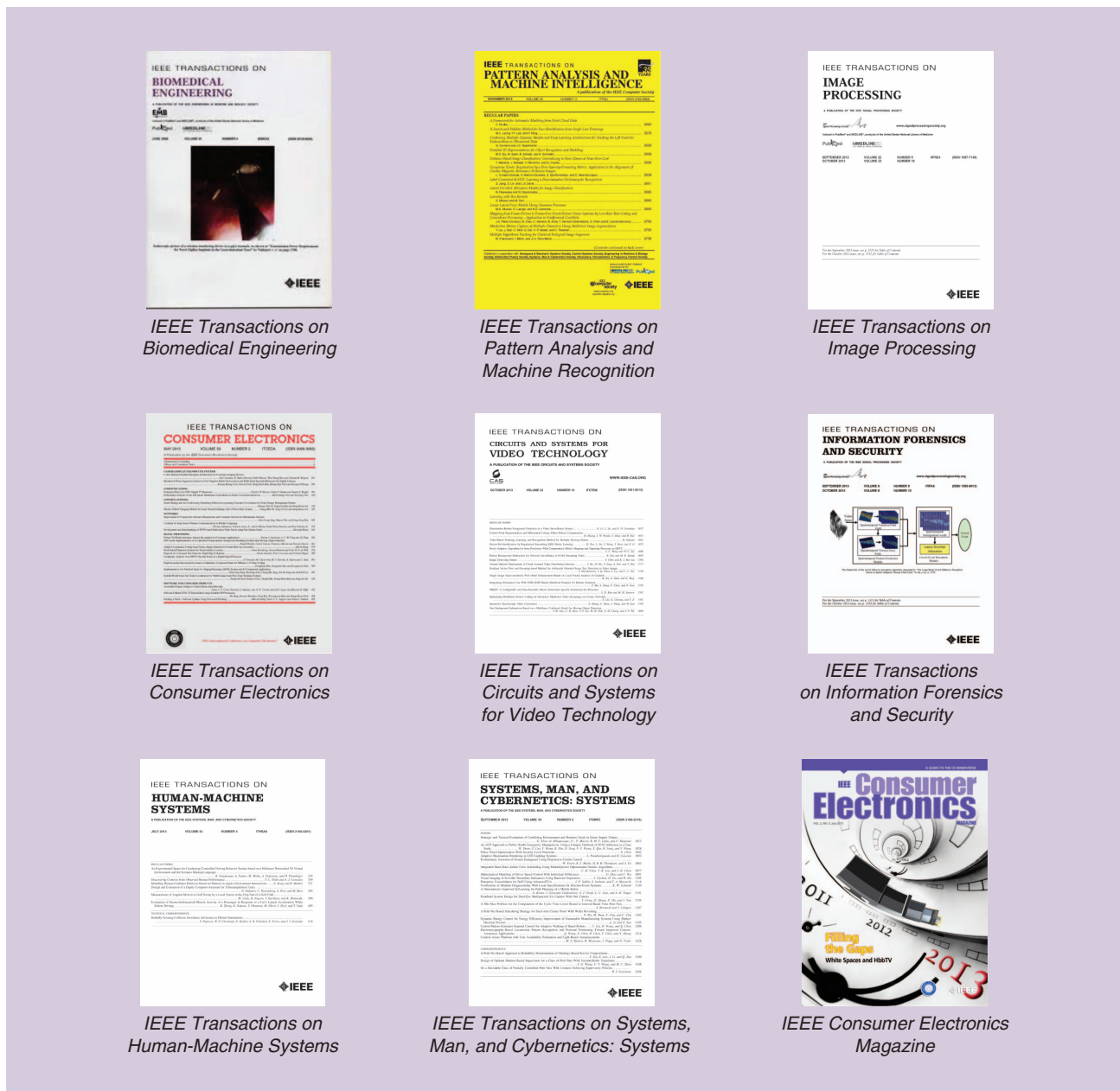
FIGURE 1. Cover pages from some of the main IEEE publications that contribute to the IEEE Biometrics Compendium .

Here, we are giving you the next-best thing—a shortened and somewhat truncated synopsis of the latest quarterly IEEE Biometrics Compendium . It is not quite the real thing, but