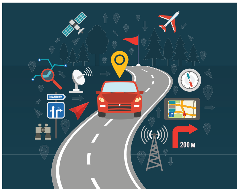
Fig. 1. The vision of cars used as pervasive sensing platforms: CAN data are communicated to remote servers through wireless communication, possibly after onboard processing and aggregation. GPS signal is fundamental to build time- and spatially-resolved databases from the multiple data streams collected by a single vehicle, as well as from data generated by different vehicles.

Volkswagen Group of America Electronics Research Lab Belmont, MA 02139 USA