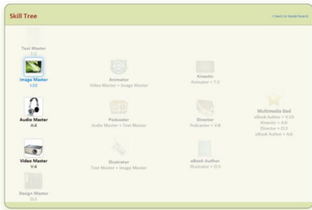
Fig. 2. The MCP skill tree.

We have previously shown that our approach is effective at engaging students [21], [22], with them presenting higher levels of participation as compared to previous non-gamified versions of the course, and reporting to be more motivated, interested and learning easier, compared to other regular courses.