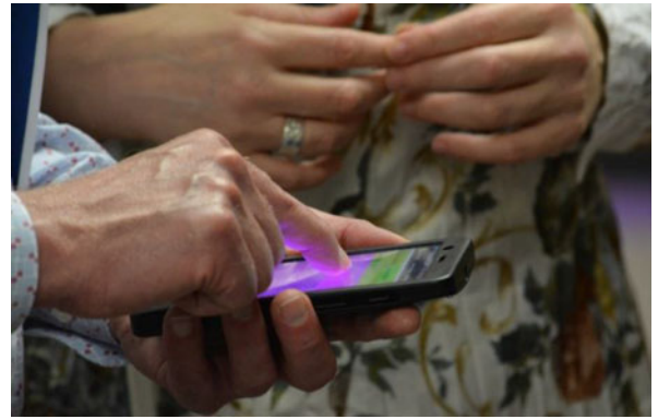
Fig. 2. Person using the HelloHapticWorld app on the TPad phone.