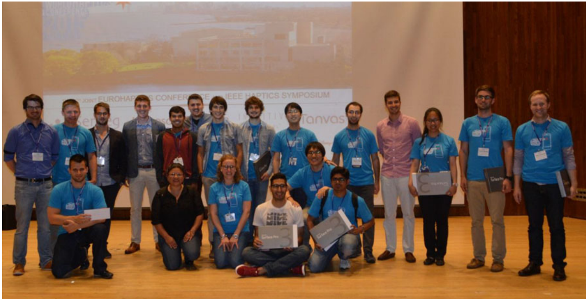
Fig. 3. Participants of the student innovation challenge at World Haptics.