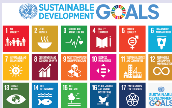
FIGURE 3 A Set of the Sustainable Development Goals Introduced by the United Nations [12].

is currently intersecting with artificial intelligence, quantum science, 5G/6G wireless communication, biotechnology and advanced manufacturing, probably being one of the main factors leading the next industrial revolution. Due to the multidisciplinary nature of nanotechnology, and its intimate relationship with concerning socio-economic issues and implications, education and learning in this area are further complicated. To this aim, there is a need for proactive research for creating virtual information centers for the public, teachers, and industry. In this framework, several key factors must be considered, focusing on the development of undergraduate curricula, career advancement and fostering the research potential of graduate, postdoctoral, and faculty researchers. Accordingly, during the COVID-19 pandemic, the first edition of the World Nanotechnology Marathon was a virtual solution, based on a creative concept and a new educational approach that generated a noticeable interest by providing access to a large and relevant variety of topics across nanotechnology to anyone regardless of the time zone. The 24 talks, during a 24-hour period, reached hundreds of participants, ranging from undergraduates to mid-career researchers, providing unique access to the nanotechnology world.