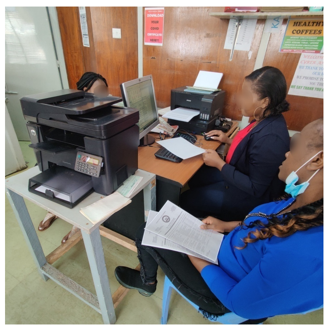
(a) Customers using computers in a cybercafe.(b) A customer receiving assistance in a cybercafe.Figure 1: Customers at different cybercafes in the Central Business District in Nairobi, Kenya, in July 2022.