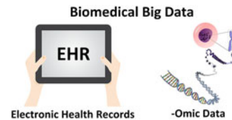
Fig. 1. Key types of biomedical big data for precision medicine.

Digital Object Identifier 10.1109/TBME.2016.2573285