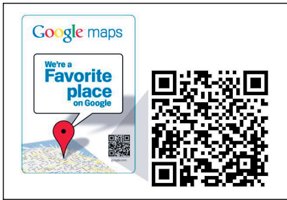
Figure 2. Google Favorite Places. Businesses display a sticker containing a QR code that passersby can scan to access more information, such as customer reviews.

as a favorite, as measured by Google Maps' search results. The sticker contains a QR code that passersby can use to access more information, such as customer reviews, ratings, maps, and contact information, as well as a link to the business's Web site and potentially even coupons.