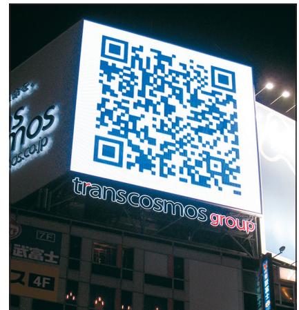
Figure 1. Quick Response (QR) code. Users take a picture of the code with their mobile phone; the phone's software then decodes the image and directs the phone's Web browser to the URL stored in the code.

QR codes became an ISO international standard (ISO/IEC 18004) nearly a decade ago. They're in widespread use in Asia, particularly in Japan, where they often appear on billboards (see Figure 1), at bus stops, on LCD advertising, and even on food wrappers. They're also common in Europe, although not as routinely visible. If people in these countries snap a photo of the QR code using their mobile phone's camera, the