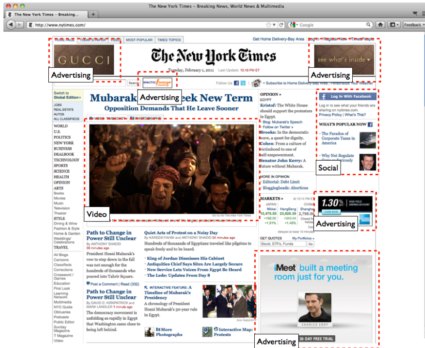
Figure 1. Third-party advertising, social, and video content on the New York Times website. Analytics content is not visible.

Web measurement provides objective, reliable evidence that both furthers public understanding and establishes a sound basis for policymaking.