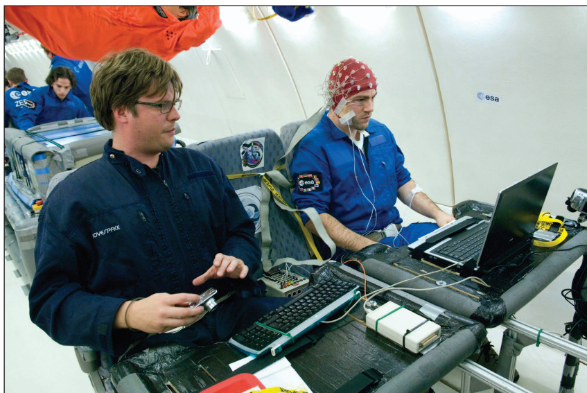
Fig. 3. Validation of a non-invasive brain-machine interface for space applications during a parabolic flight (note a person floating in the top left corner). The subject needs to operate the BMI in different gravity conditions, including microgravity. This study was run in collaboration with the European Space Agency's Advanced Concept Team.

Microelectrode arrays are the most invasive of the techniques used in BMI systems. To date, this is the only recording technique that allows decoding the intended movements of the subject's limb with high accuracy. This technique allows recording SUA from large populations of neurons from multiple areas of the brain simultaneously. Arrays are chronically implanted in cortical areas of the brain. Typical areas include the primary motor cortex (M1), the dorsal premotor cortex (PMd), and the posterior parietal cortex (PPC). Of great concern with this technique is the long-term stability of the recordings. The brain