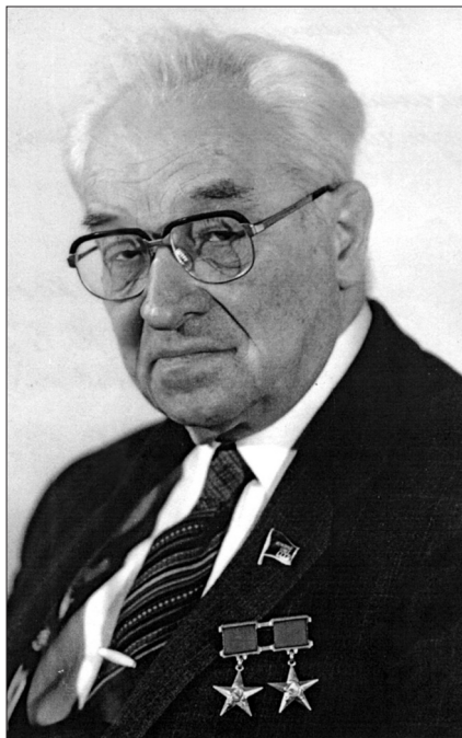
Figure 3. Kotelnikov in later years

army seemed likely to reach Moscow, Kotelnikov's laboratory, together with other scientific establishments, was evacuated to Ufa, around 1000 km to the east. There the laboratory continued to work on secure radio telephony, and by the beginning of 1943 such equipment was being produced on a large scale for the Red Army, having been tested the year before during the battle of Stalingrad. The encryption equipment was later used during negotiations at the Tehran, Yalta, and Potsdam Conferences.