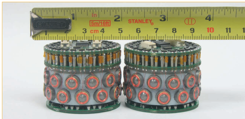
Figure 1. Claytronic atom prototypes. Each 44-mm-diameter catom is equipped with 24 electromagnets arranged in a pair of stacked rings.

bility, powering million-robot ensembles, and surface contour control without global motion planning.